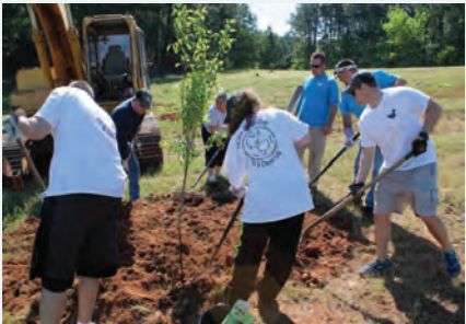
HCWA employees and volunteers plant trees at the Cubihatcha Center during this year’s Earth Day Celebration.

Come see the improvements to the Cubihatcha Center, located at 100 Collins Road in Locust Grove, by taking a tour or hike, or by scheduling a group outing. For more information, call us at 678-583-3930, or follow us on Facebook at www.facebook.com/CubihatchaOutdoorCenter .