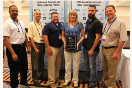
The HCWA Bear Creek Plant staff celebrates winning the 2016 GAWP Plant of the Year Award for wastewater treatment facilities with a capacity from 1.1 to 10 million gallons per day (MGD).