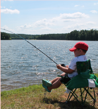
This year's Family Fishing Day will be held on Saturday June 10, 2023.

Department of Natural Resources allows fishing on Georgia waters without a permit, to promote the sport and encourage outdoor recreation and education.