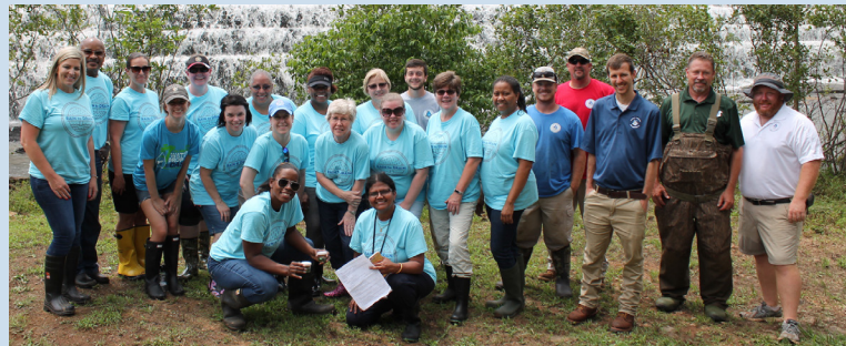
The HCWA Rain to Drain Workshops have educated approximately 70 Henry County teachers, such as those pictured during a class prior to the pandemic. As a result, the Metro Water District honored the HCWA with an honorable mention STREAM Award.

The HCWA is taking the Rain to Drain workshop model and creating a Citizen Academy this summer, when local residents can learn all about their water utility's facilities and operations through a similar workshop setting. (Please see Citizen Academy program info on page 1.)