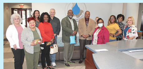
The HCWA presented gift cards to winners of a special drawing among those 1,600 customers who completed a customer service survey.