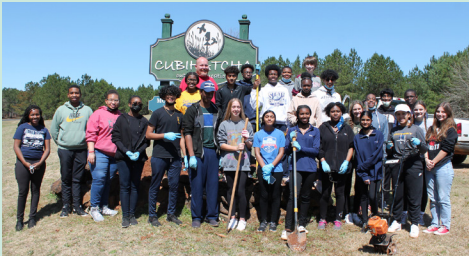
The HCWA hosted the 2022 Youth Leadership Henry class recently at its Tussahaw Plant and Cubihatcha Center.

For the complete News story and Photo Galleries on the Youth Leadership Henry class visit, please visit our website at www.hcwa.com .