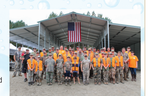
The HCWA hosted another successful Hunting Season, evident in the feedback received from those taking part in the Youth Deer Hunt on Oct. 14 (pictured) and similar events during the fall.

The HCWA hosts these limited public hunts as a part of its regulated land management practices, which include conservation of natural resources and preservation of wildlife habitat.