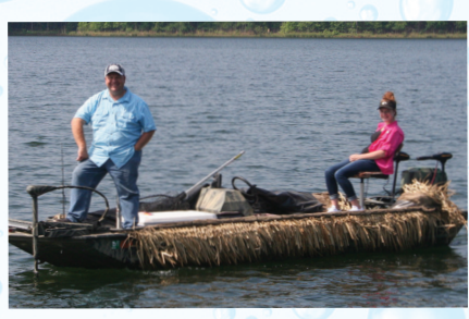
The HCWA Fishing Season extends through three select weekends this winter, before resuming in full the first weekend in March.

The 2017-18 Winter Fishing dates at the HCWA include the weekends (Fridays to Sundays) of Dec. 8 – 10, 2017; Jan. 19 – 21, 2018; and Feb. 16-18, 2018. The Authority will open its Tussahaw Reservoir for fishing, as well as canoeing and kayaking, from 7:00 a.m. to 5:00 p.m. on these select dates.