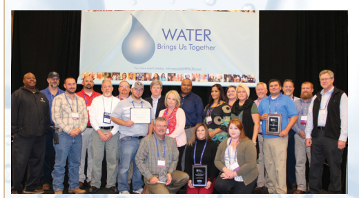
Award winners from the HCWA gathered for a group photo during the Fall Conference of the Georgia Association of Water Professionals

The evidence of HCWA success this past year comes in the form of industry awards the Authority received during the Annual Conference and yearend