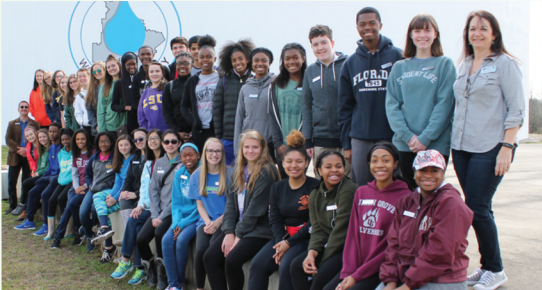
The 2017-18 class of Youth Leadership Henry (pictured) toured the HCWA Towaliga Plant to learn about local water resources and what they can do to protect them.

Youth Leadership Henry is one of the most critically important programs of the Henry County Chamber of Commerce. As such, the Authority hopes to include its system, facilities and operations, among the highlights of the program’s orientation for local students – our community’s future leaders. The 2017-18 class of Youth Leadership Henry toured the HCWA Towaliga Water Treatment Plant on March 10, to learn about water resources in their community and what they can do to protect them. Afterward, the students participated in a service project to cleanup areas near the HCWA Gardner Reservoir. The purpose of Youth Leadership Henry is to identify emerging leaders among local high school students, bring them together in an atmosphere conducive to the free exchange of ideas, and to provide them with an enlightening educational experience. Participants are taught leadership skills while learning about various government, economic, and social sectors of the community.