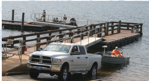
The HCWA Tussahaw (pictured) and Upper Towaliga Reservoirs will be accessible for public fishing during the Authority's 2018 Regular Fishing Season, which runs from March 2 thru the end of November.

The 2018 HCWA Fishing Season opened March 2 and runs through the last weekend of November. The public now has an opportunity to fish the Tussahaw and Upper Towaliga Reservoirs on Wednesdays, Fridays, Saturdays and Sundays, from 7:00 a.m. to 7:00 p.m. (The Authority staff reserves the right to close the reservoirs for fishing on a scheduled day, in the event of maintenance, severe weather, or for