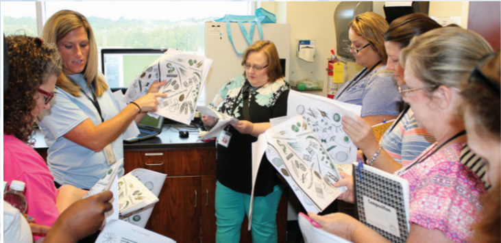
The success of the HCWA “Rain to Drain” workshops last summer for teachers from Henry County Schools (pictured) has gained the attention of the National Science Teachers Association, who invited the Authority to present a ‘how to’ technical session during its National Conference in Atlanta in March.

Last summer, the HCWA hosted approximately 20 science teachers from Henry County Schools for four days of “Rain to Drain” workshops, introducing them to water professionals and facilities that might be of interest to their students. The success of this public education program resulted in an invite for the Authority to present ‘how to’ insights on “Rain to Drain” workshops to members of the National Science Teachers Association (NSTA). During the NSTA National Conference, held at the Georgia World Congress Center March 15-18, the HCWA’s “Rain to Drain” presentation was among the more than 1,200 educational sessions on important topics for science teachers.