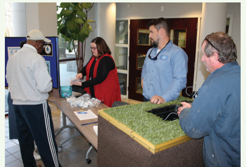
HCWA employees shared tips with customers on how to find and fix household leaks during national Fix a Leak Week, which was March 19-25, 2018.

For more information on finding and fixing household leaks, check out our website at www.hcwa.com or the EPA WaterSense Program at www.epa.gov/watersense .