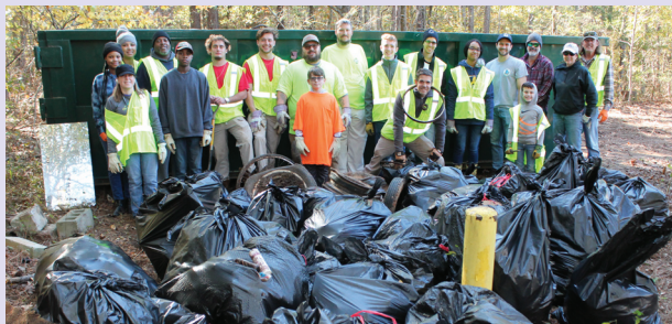
Employees from the HCWA and Henry County Stormwater Management joined other volunteers to clean a site off of East Lake Parkway in McDonough during this year’s Henry County Rivers Alive cleanup.

The annual river cleanup took place at a location off of East Lake Parkway in McDonough that had been used as a “dumping site,” according to Authority officials. Thanks to the efforts of 18 volunteers, this year’s Henry County Rivers Alive eliminated more than 3.5 tons of trash, as well as an additional 4.29 tons of tires (more than 300 total) to be recycled.