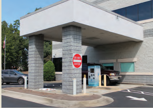
The HCWA will be converting Lane 2 of its Drive Thru at the Headquarters Building from a Kiosk to a second customer service lane.

In addition to paying your bill via the drive-thru lanes, customers can come into the