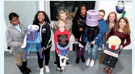
While students won't be able to gather together like these pictured last year, this year's Georgia Model Water Tower Competition will be held virtually, with judging on Nov. 6, based on each tower's structural and hydraulic efficiency, as well as design ingenuity.

The winners of the 2020 Henry County, Georgia Model Water Tower Competition will be revealed in the next issue (Winter 2021) of this Currents customer newsletter, as well as on our website at www.hcwa.com .