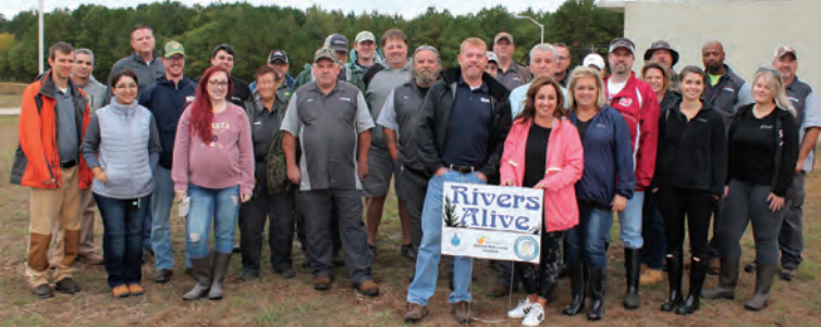
Employees from Atlanta Motor Speedway, pictured here at last year's Henry County Rivers Alive event, are conducting another waterway cleanup on Nov 9th, at the HCWA Gardner Reservoir.